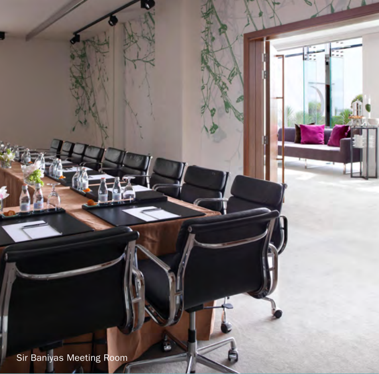
Sir Baniyas Meeting Room