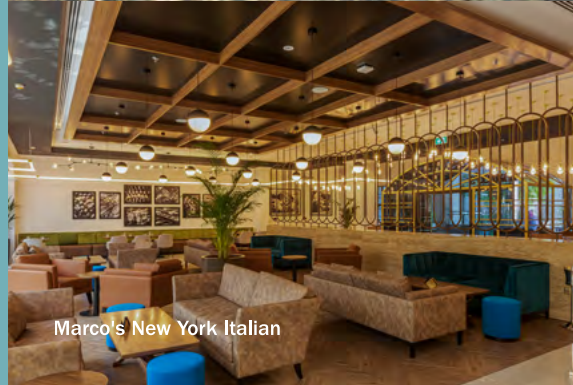
Marco's New York Italian